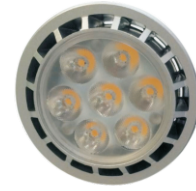
Model : IMR16-A05-H108E