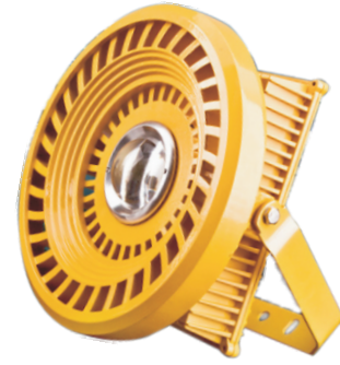
Model : EP-GMD80-H108E