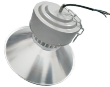
Model : HB-A40-N118B